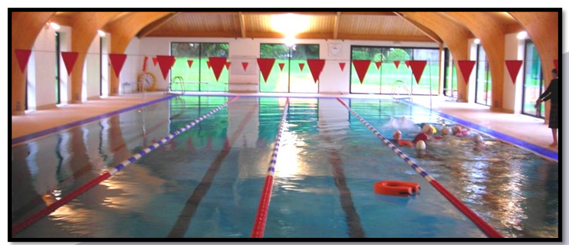
St Teresa's Swimming Pool